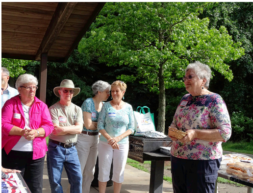
The 2015 TVIH picnic at East Cedar Lane

It's that time of year again. Summer is here and so is our Annual Picnic. Come on out on Sunday, June 12th to East Cedar Lane Park on Route 108 at 4pm. Same location