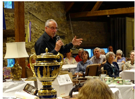
The 2015 Appraisal Road Show at Oliver's Carriage House

Tell your friends and neighbors!!! The Appraisal Road Show is back and open to all. Bring an item to be appraised by Paradigm Experts. Bring some jewelry, time pieces, rare books, furniture, vintage toys or historic