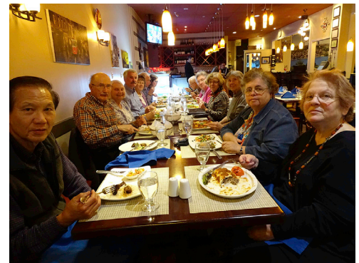
Restaurant night at Rudy's in Columbia.

Restaurant Night at Pho Dat Thanh. This Vietnamese restaurant was given 4 out of 5 stars by Trip Advisor. Pho is a soup typically made from beef stock with spices and noodles. We will meet at the restaurant located at 9400 Snowden River Parkway in Columbia at 5pm on Sunday, June 26th. Space is limited so you will want to sign up early. Click the "Registrants" button on the website to see who is coming.