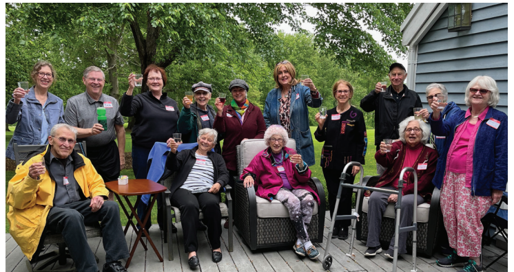
June 28th at 4 PM