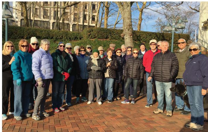
Sneakers and coffee.

Join us in May at Bare Bones Grill & Brewery, 9150-22 Baltimore Natl. Pike, Ellicott City, MD 21042, known for its lively brew and hearty American fare.