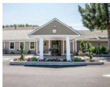
Inn at Mendenhall

Brandywine Valley has an extensive array of holiday related events: Brandywine Museum; Hagley Museum; Longwood Gardens and Winterthur. Join us on December 12/13 to see these sights and for an overnight stay at the Inn of Mendenhall. The website has all the details.