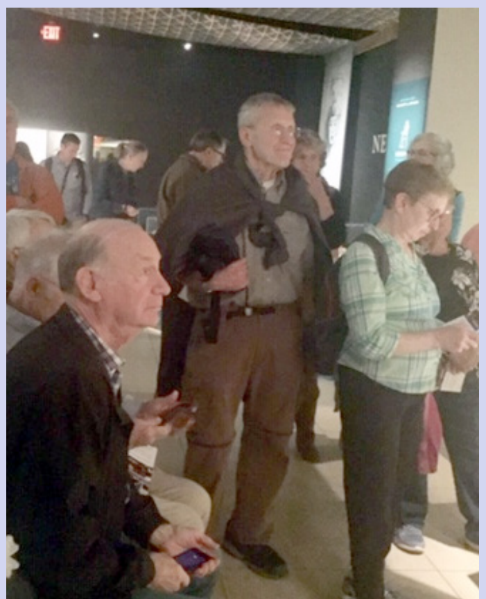
TVIH visits the Queens of Egypt Exhibit at the National Geographic Museum

The TVIH Players invite you to enjoy an evening of comradery, fun, singing and delicious home-cooked food.