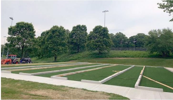
Four turf bocce courts under construction at Cedar Lane Park West.