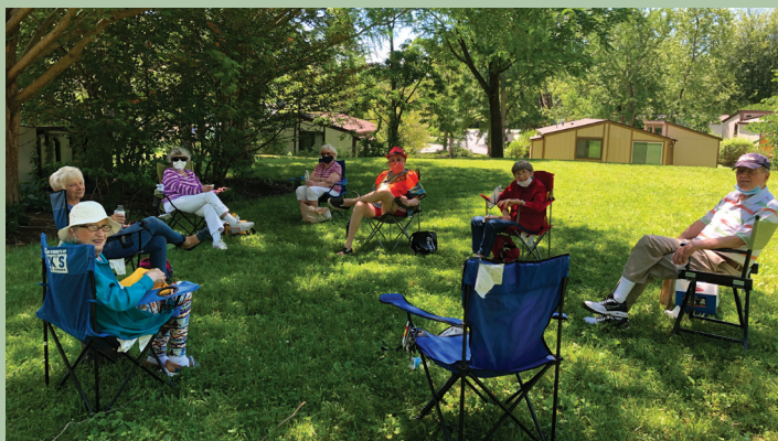
Lunch Bunch on the Green