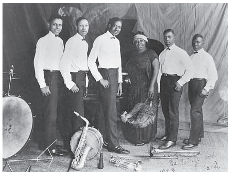
Ma Rainey and her band (1923)