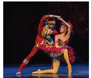
Royal Ballet: The Firebird, music by Stravinsky

Continuing the December Listen! more music, dancing, and art. Beethoven, Stravinsky, Prokofiev, Balanchine, Louis Armstrong, Miles Davis, more African and Asian music and dance- and more!